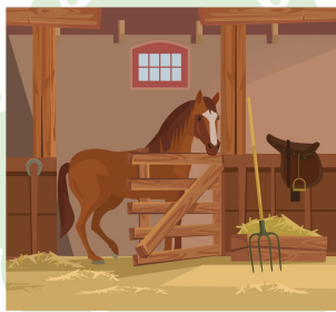
a horse in a stable