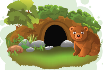
a bear in a cave