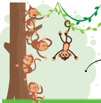
monkeys on a tree