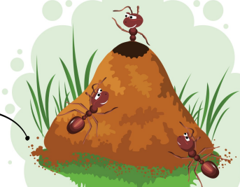
ants in an anthill