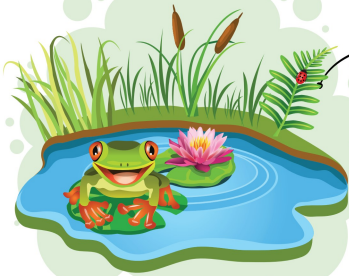
a frog in a pond