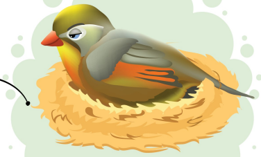
a bird in a nest