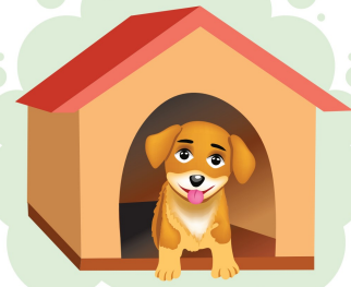
a dog in a kennel