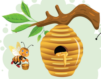
bees in a beehive