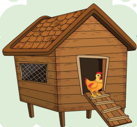
a hen in a coop