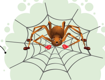
a spider in a web