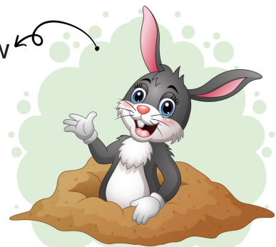
a rabbit in a burrow