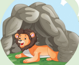
a lion in a den

A variety of animals are found in different parts of the world. They differ in sizes, shapes, colours and the places they live in. Like other living things, animals also need food, water and shelter. Every animal has a house of its own. Animals need houses to rest and protect themselves from danger. Let us look at the names of a few animal homes.